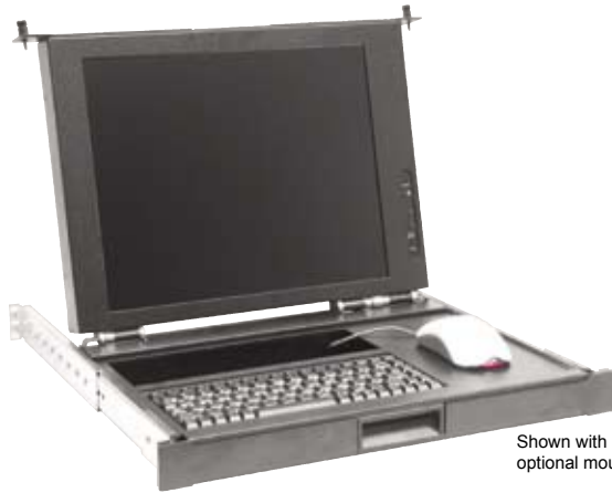
Shown with optional mouse.