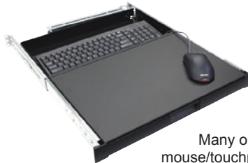
Many optional keyboard and mouse/touchpad/trackball combinations