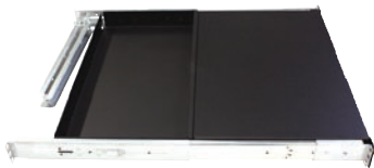
Optional cable management installed