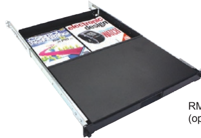
RMS-102 Storage space (optional retainer screws)