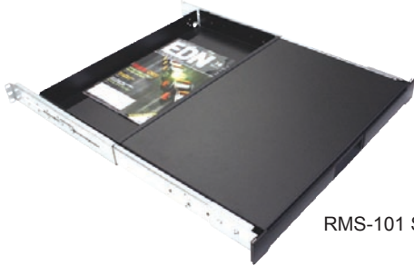
RMS-101 Storage space