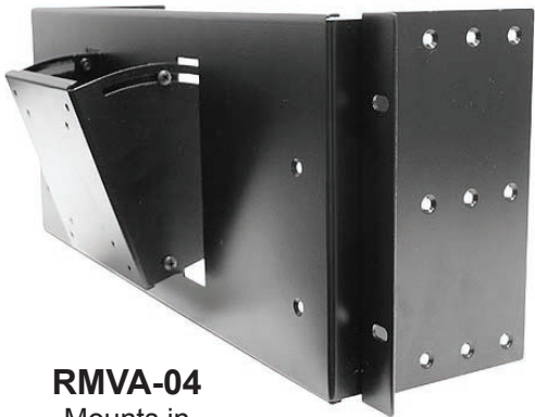
RMVA-04 Mounts in 4U of Rack Space

The adjustable mounting bracket RMVA-04 has VESA mount holes for 75x75 mm and 100x100 mm monitors. 100x200 mm monitors can be mounted with an adapter plate. This bracket mounts in 4U (7.0") of vertical rack space and allows the attached monitor to be titled in the down (or up) direction. The bracket in and out depth is also adjustable in 4 different increments. The bracket can also be supplied with an RMVS-01/02 shelf attached to allow use of space behind the monitor for additional equipment storage.