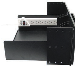
RMVA-04 with RMVS-02 Attached

We offer OEM and custom designs for your applications. Contact us for additional information.