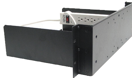
RMVF-03 with RMVS-02 Attached