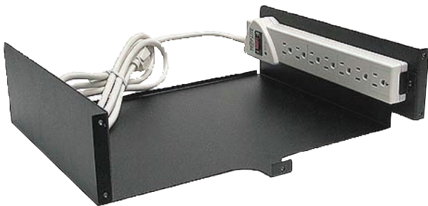
RMVS-02 RMVS-01 (without power strip) Attaches to RMVF-03 and RMVA-04