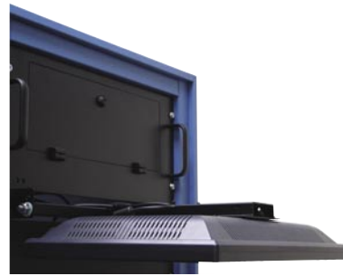
RMVM-100 Mounted so monitor tilts down.