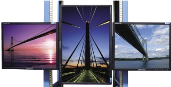
Dual 17" and Single 22" Monitors