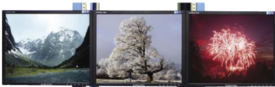
Triple 17" Monitors