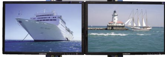
Dual 24" Monitors