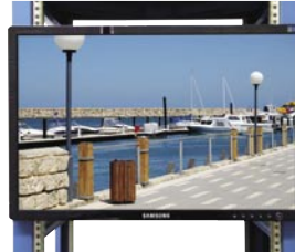
Single 24" Monitor