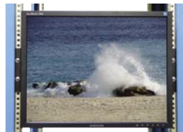
Single 20" Monitor

Monitors may be mounted in portrait and/or landscape directions as well as mixing different sizes as shown in examples below: