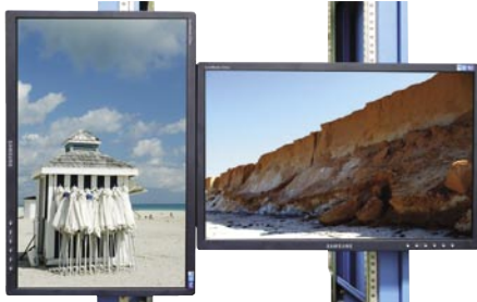
Dual 22" Monitors

The single or multiple monitor mounting system provides rack mounting of VESA Standard (75mm, 100mm and 100 x 200mm) mount monitors in single and multiple mounting configurations.